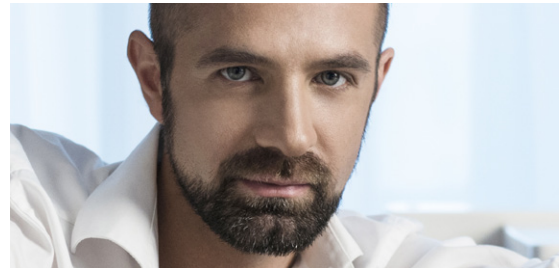
Max Emanuel Cencic ( Andronico )