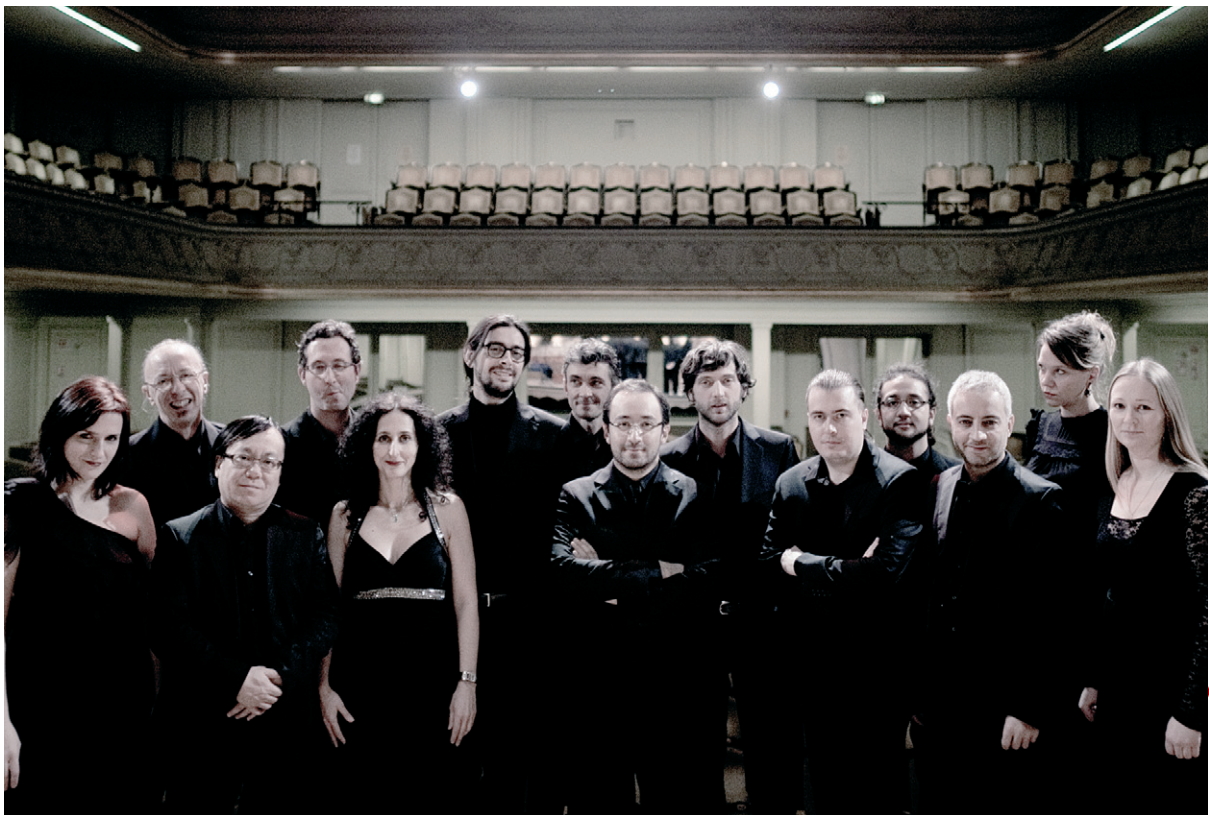
Il Pomo d'Oro (orchestra)