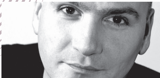
John Mark Ainsley ( Bajazet )