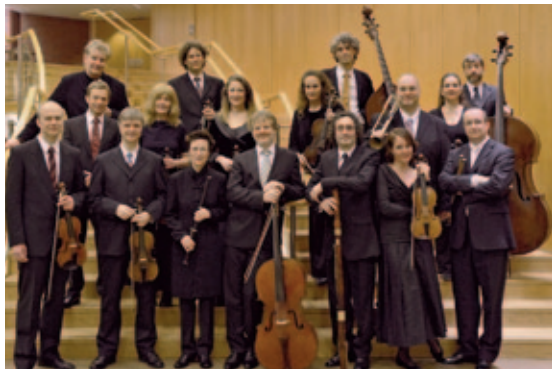
Concerto Köln (orchestra)