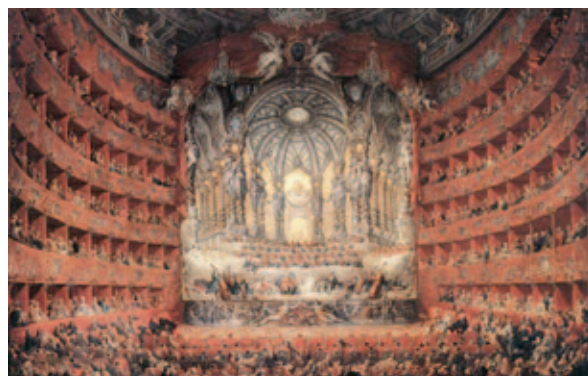
Teatro Argentina Roma