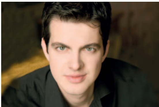
Philippe JAROUSSKY (Artaserse)