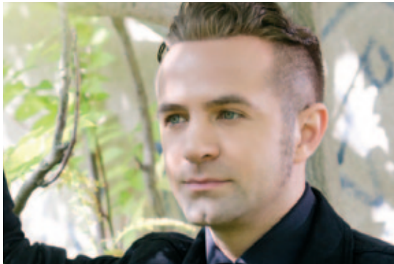
Max Emanuel CENCIC (Mandane)